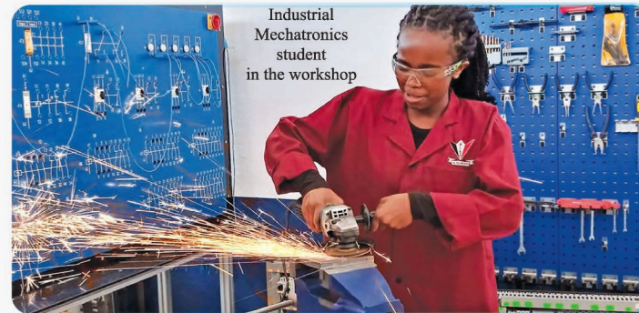
Industrial Mechatronics student in the workshop