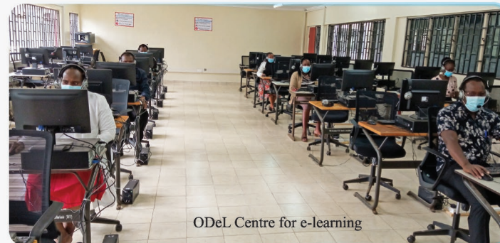
ODEL Centre for e-learning