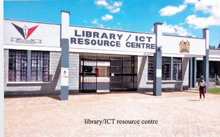
library/ICT resource centre