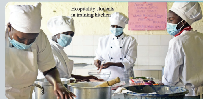
Hospitality students in training kitchen