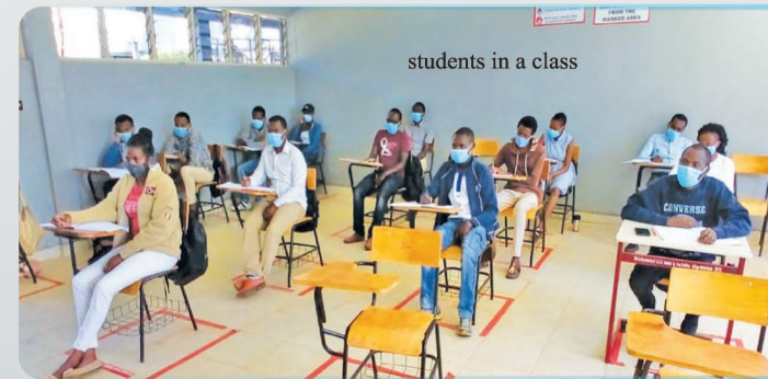
students in a class